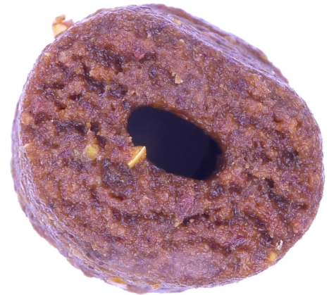
Sample Photo: Hempbone Bacon Apple Donuts

■ THC % ■ CBD % ■ CBN % ■ THCA % ■ ■ CBG % ■ CBC % ■ CBDV % ■ CBGA % ■